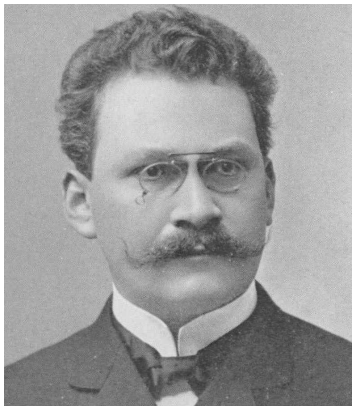
Space and Time: 1908 - 2018

Organized by the Minkowski Institute (Montreal) and the International Society for the Advanced Study of Spacetime